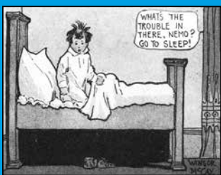
Little Nemo - Winsor Mc Cay - 1905

16:20 Sleep in comic strips - Geneviève Aubert (Brussels, BE)