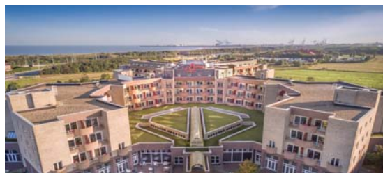
Floreal Club, Blankenberge, Belgium

The Belgian Association for Sleep research and Sleep medicine (BASS) announces the next edition of the International Sleep Medicine Course ISMC 2020. This event will take place from Monday 27/04/2020 till Thursday 30/04/2020 at the Floreal Club in Blankenberge.